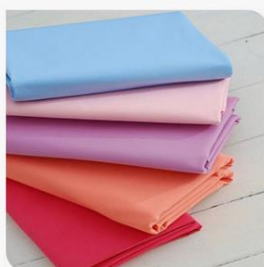
cotton lining fabric

LOW PRICE polyester cotton TWILL uniform workwear 3/1 fabric: bagging fabric