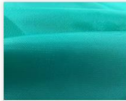
2017 Fashionable Flower Printed PU Fabric for Jacket