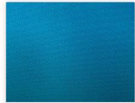
Stretch Plain Woven 100% Polyester Fabric for Garment and Lining