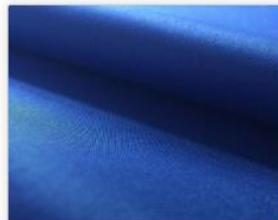
Nylon Water-Proof Fabric with Woven