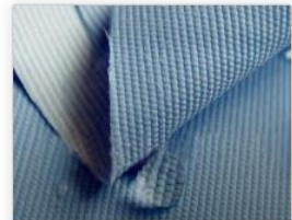
Nylon Taslon Oxford Print Woven Fabric