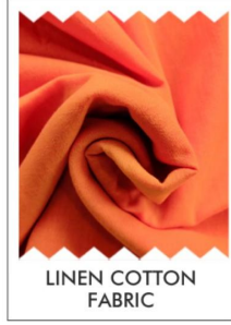
LINEN COTTON FABRIC