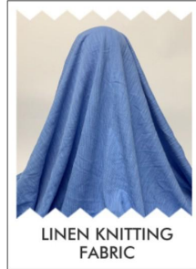
LINEN KNITTING FABRIC