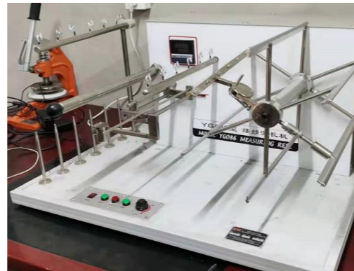
Yarn test lab