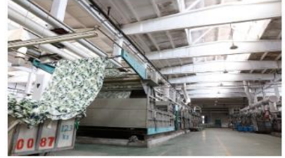
Flat washing machine