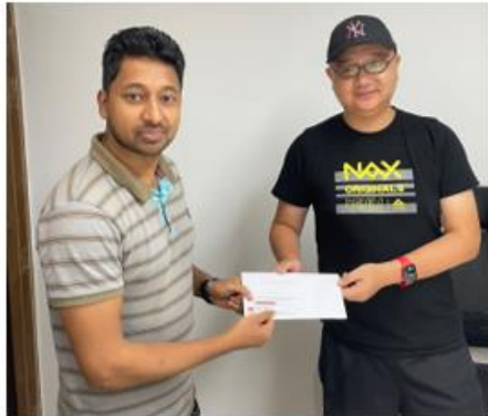
Honorable MD & Country Incharge

A team that's empowered, diverse and inclusive with a love of innovation in Textile and Fashion that united us