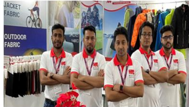
Intex SouthAsia Exhibition-2021