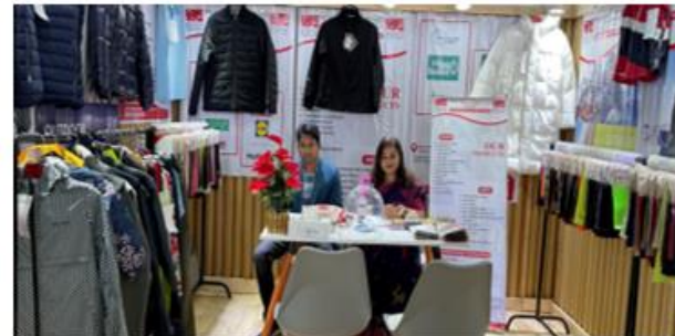
Dhaka Apparel Expo-2022