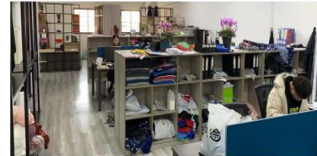
Head Office Work Environment