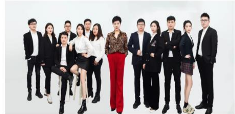
Our Head Office Team